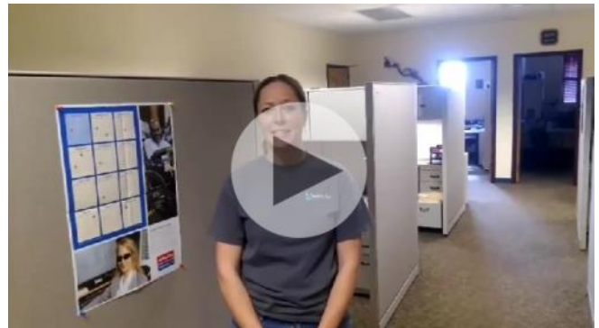
2nd Place (tie): Human Resources