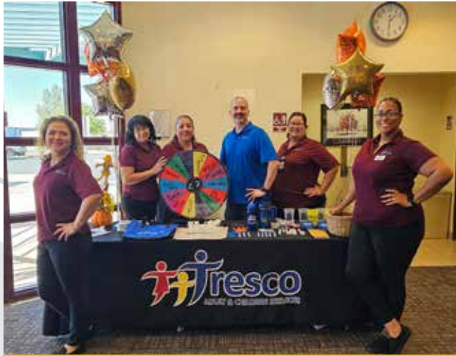
Las Cruces job fair at Tresco with Adams Radio