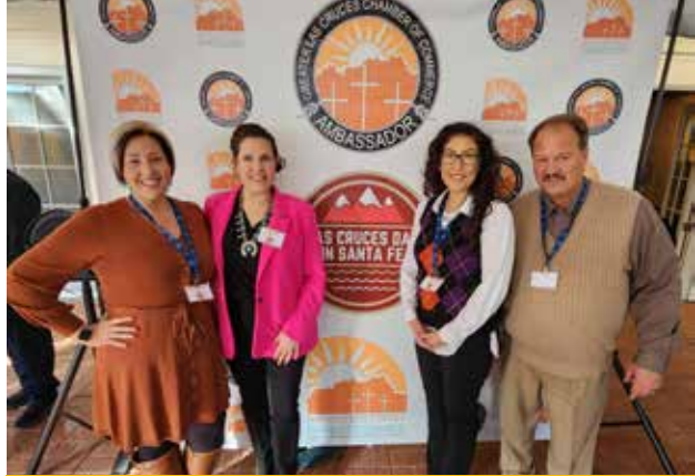
Tresco is proud to be a sponsor of the 2024 Las Cruces Day in Santa Fe and an active partner with the Greater Las Cruces Chamber of Commerce

As the weekend drew to a close, we left with a renewed sense of purpose and determination. It is a reminder that our voices do matter and together, we have the power to create awareness and change for our communities.