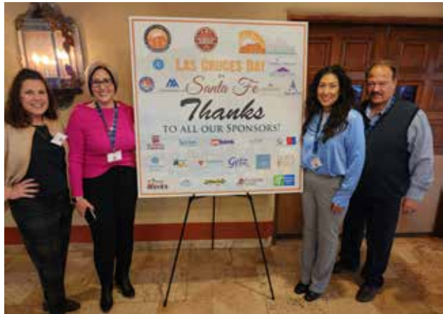
Great start to a weekend of advocacy with the Greater Las Cruces Chamber of Commerce!